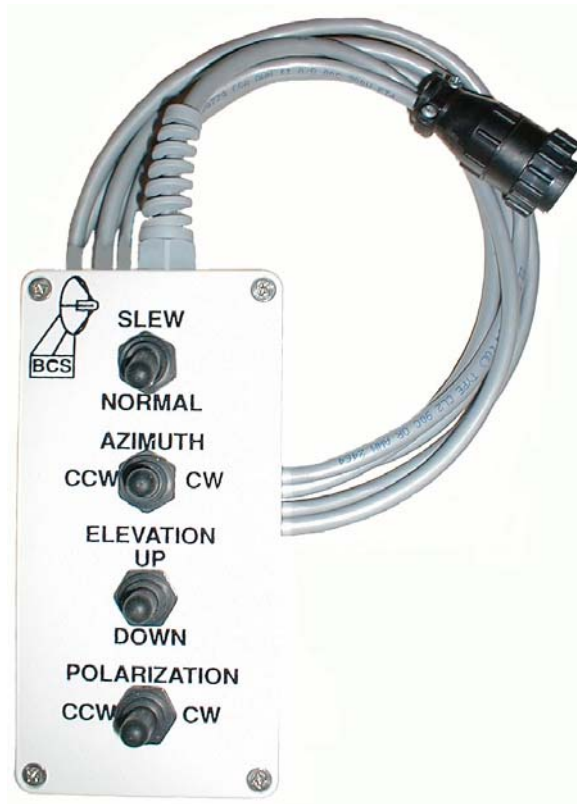
MCU Handheld Controller