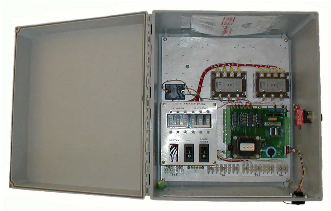
Single Speed MCU4 (Cover Door Open)

The following typical photographs of the MCU4 and MCU Handheld Controller may be referred to for the functional discussion in Section C.