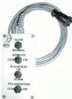
Handheld Control Unit

The MCU4 Motor Control Unit is an antenna mounted Solid State Relay (SSR) based unit responsible for single or dual speed control of the antenna motors in response to commands issued by either the ACU1 or the Handheld Controller. The unit is also responsible for handling antenna limit switch and emergency stop button logic, motor circuit protection, ACU1 / Handheld control logic, as well as providing fault and interlock status to the ACU1. Housed in a weatherproof enclosure, the MCU4 is ideally suited for the outdoor environment. The MCU4 uses solid state zero crossing technology for controlling axis motors providing for smooth operation and long relay life when compared to conventional reversing contactors. The MCU4 is the ideal solution where low cost is required over variable speed.