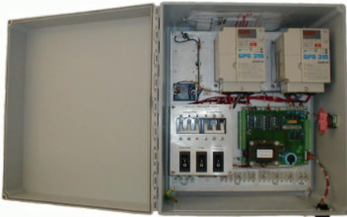
MCU3 Motor Control Unit

The Tracking Receiver is a rack mounted receiver that provides an analog voltage proportional to signal strength to the ACU1 for use in peaking the antenna during Steptrack.