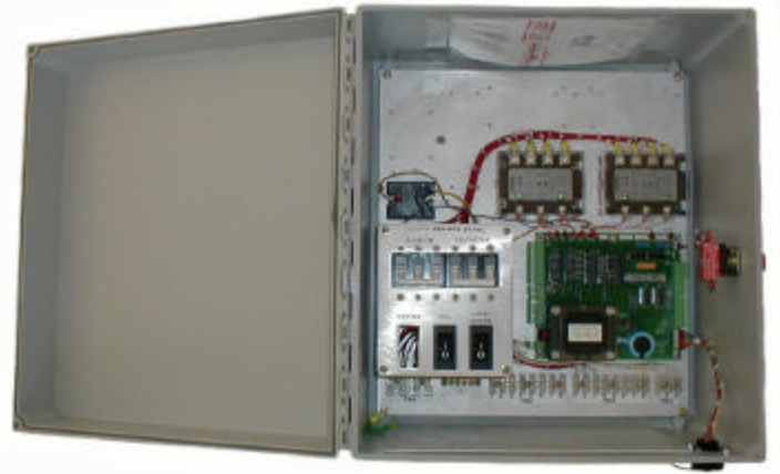
MCU4 Motor Control Unit

The MCU3 Motor Control Unit is an antenna mounted Variable Frequency Drive (VFD) based unit responsible for dual speed control of the antenna motors in response to commands issued by either the ACU1 or the Handheld Controller. The unit is also responsible for handling antenna limit switch and emergency stop button logic, motor circuit protection, ACU1 / Handheld control logic, as well as providing fault and interlock status to the ACU1. Housed in an automatically heated weatherproof enclosure, the MCU3 is ideally suited for the outdoor environment. The MCU3 provides adjustable and consistent axis motor speed (in both normal and slew speeds) as well as dynamic motor braking allowing for a more precise positioning and better overall tracking performance.